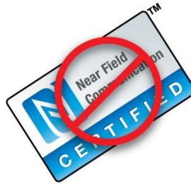
Figure 6: Certification Mark Rotated on its Axis