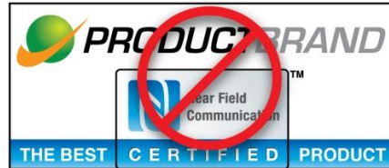
Figure 9: Certification Mark Incorporated Incorrectly into Another Logo

Do not integrate the Certification Mark in any company-specific or other proprietary mark or logo in a manner that creates the overall impression of a single, unitary mark (see Figure 9).