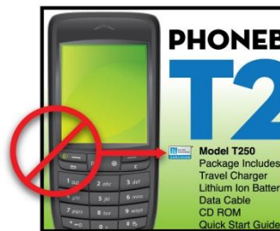
Figure 7: Certification Mark Too Small to be Legible