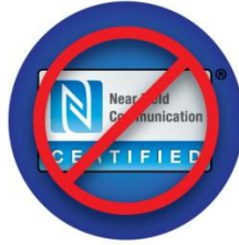
Figure 4: Certification Mark Inside a Circle