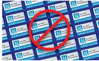
Figure 5: Certification Mark in a Tile Pattern