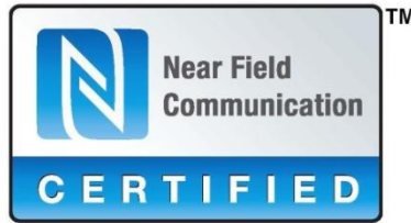
Figure 1: Certification Mark

You may directly replace the “TM” in the Certification Mark with the “R” symbol as appropriate, contingent upon the registration status of the Certification Mark in any given jurisdiction. For the current registration status for each jurisdiction, see http://www.nfc-forum.org/members/certification_members/marks/ .