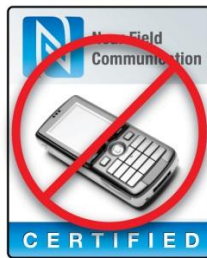
Figure 2: Certification Mark Broken Apart

Examples of inappropriate uses of the Certification Mark include, but are not limited to, the following graphics.